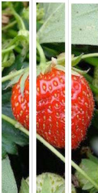
Erd bee re