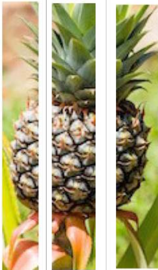
A na nas