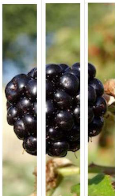
Brom bee re