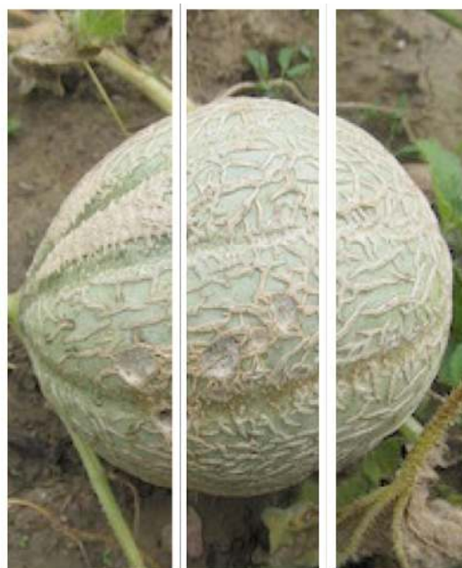
Me lo ne